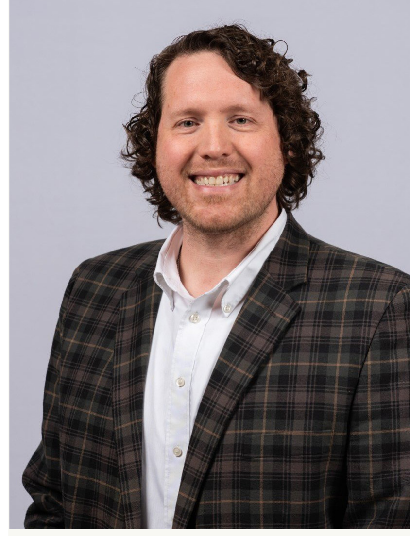
What vision do you have for the long-term future of the Higher Education department?

As with any substantial multi-phase program, we want the "rollout" to be intentional, measured, and timely in the hopes of ensuring program reception, utilization, and success. Ideally, we will begin taking applications for students to enter Phase 1 of our program as early as the fall of 2022. Our first Phase 2 funding workshop is also scheduled for this fall. We will begin student Phase 3 consultations in the 2023 new year and hope to host our first Phase 4 graduation banquet in the spring of 2023. The program is ultimately set up where students may enter a relevant phase in the cycle at any time. Flexibility and adaptability are essential for the success of any Higher Education program, as educational pathways are rarely linear and uninterrupted.